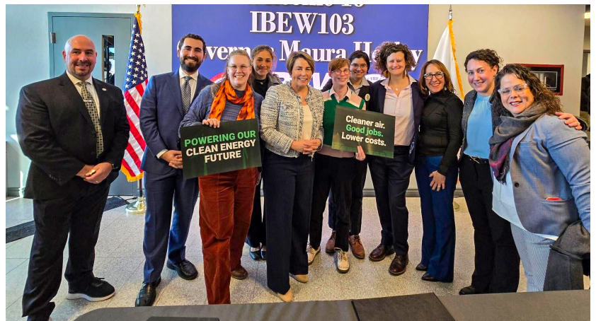
▲ Clean Water Action and allies celebrate the signing of the 2024 Climate Omnibus bill with Governor Maura Healey.

Here in New England, Massachusetts passed a massive Climate Omnibus bill just days after the election. The new law responds to concerns from Environmental Justice communities while still expanding and supporting Massachusetts' transition from fossil fuels to clean renewables. With enthusiastic labor support, Massachusetts is creating family-sustaining jobs in offshore wind and building examples of a just climate future.